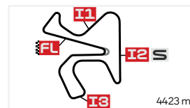
Circuito de Jerez - Ángel Nieto