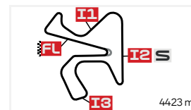
Circuito de Jerez - Ángel Nieto