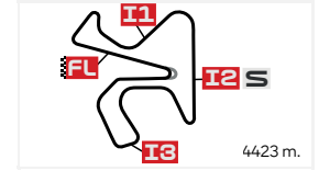
Circuito de Jerez - Ángel Nieto